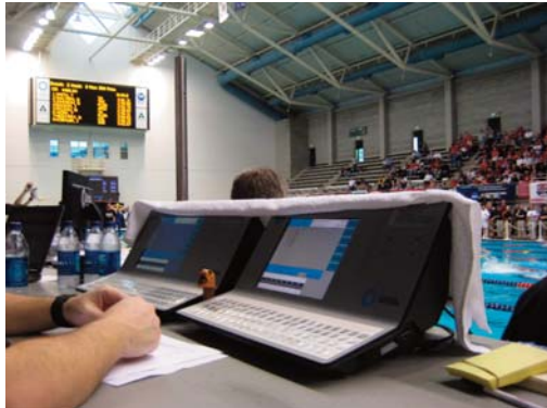
NCAA Division I Men's & Women's Championships