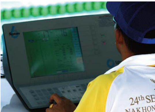
Southeast Asian Games

For over 40 years, Colorado Time Systems has led the aquatics industry with innovative, reliable products for scoring and timing. Colorado Time Systems is synonymous with precision and accuracy in swim timing.