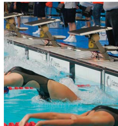
FINA World Junior Championship