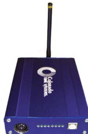
Wireless Interface (WIO-003)

Make your diving meets run more efficiently. Colorado Time Systems offers a useful addition to your System 6 Diving package. Wireless Judging Terminals allow the judges to enter their scores from the judging stations eliminating the need for runners when your judges are placed around the pool. They also eliminate the inconvenience and chance of error when having to manually enter scores from the System 6 Timing Console.