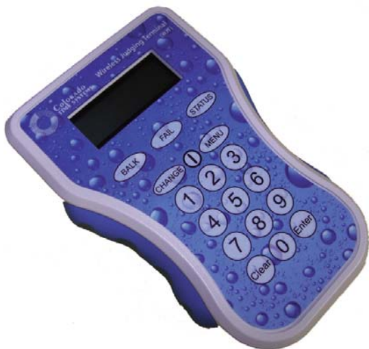
Wireless Judging Terminal (WJT-003)