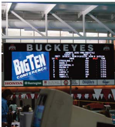
Big Ten Conference Championships

Colorado Time Systems offers extensive training courses for operating the System 6. Visit our website at www.coloradotime.com to find more information regarding the next available class and how to sign up.