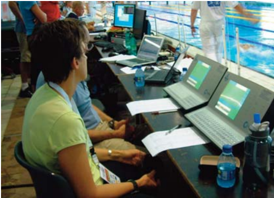
European Junior Swimming & Diving Championships