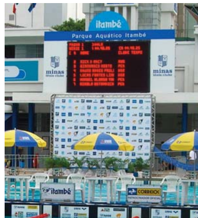
FINA World Cup, Brazil